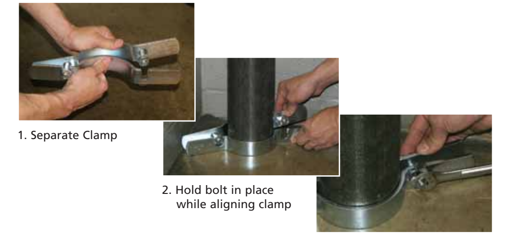
3. Tighten the nut