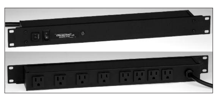
R8BZ (Front & Back)

Sentrex and Perma Power rack mount and CabinetMATE surge protectors provide advanced protection for critical electronic and communications equipment. They are an integral part of the Sentrex Zoned Approach to whole building protection.