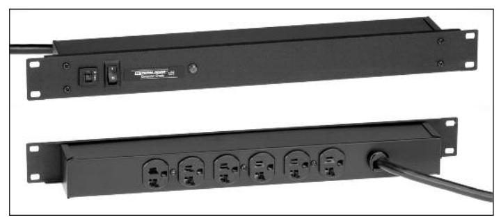
R5BZ20 (Front & Back)