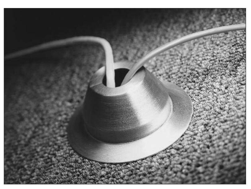
A 1200 Series Service Fitting installation on a carpeted floor.

1200 Series Service Fittings are designed to be threaded directly into a 2" IPS [51mm] preset or afterset insert to activate Walkerduct<sup>®</sup> Underfloor Duct. It can also be applied as an afterset on Walkercell<sup>®</sup> Cellular Raceway. 1200 Service Fittings are suitable for new and renovation construction and is available in aluminum and brass finishes. All power fittings are UL listed to U.S. safety standards.