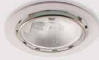
Halogen HR-88 Shown as recessed mounted White finish