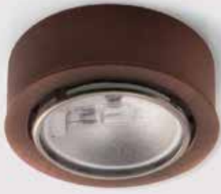
Xenon HR-86 Shown as surface mounted Copper Bronze finish