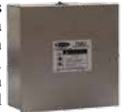
TO-SK-1 or GF-SK-1

Model "TO" & "GF" features include a positive "off" & a built-in on/off rocker switch that glows red during operation. Additionally, enclosure can mount directly to the terminal box on the back of the heater (FSP-43/95 only) or be mounted to a remote wall surface.