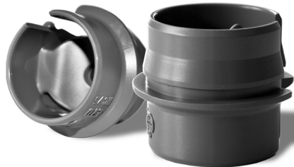
Part# RAT500 Part# RAT750

FAST & EASY - NO LOCKNUTS - NO TOOLS REQUIRED