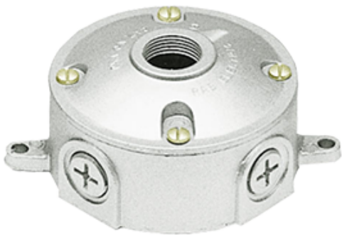
Die cast aluminum wiring box with weatherproof gasket, ground screw, and two sturdy lugs for wall or ceiling mounting. Color: Natural Weight: 0.9 lbs