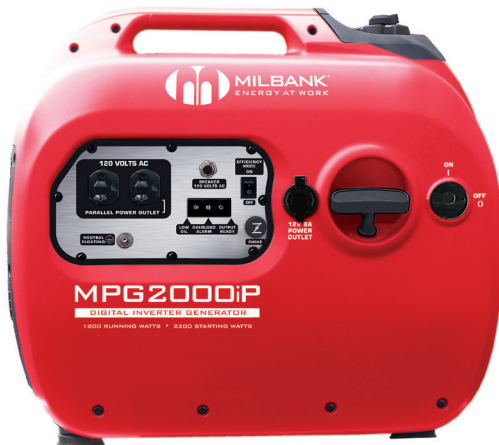
1800W | MPG2000iP