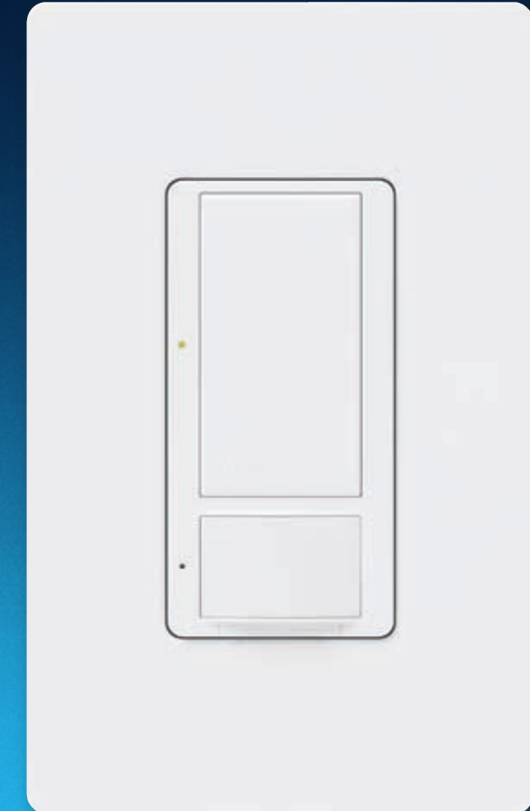
NEW Maestro occupancy/vacancy sensor with switch (actual size)