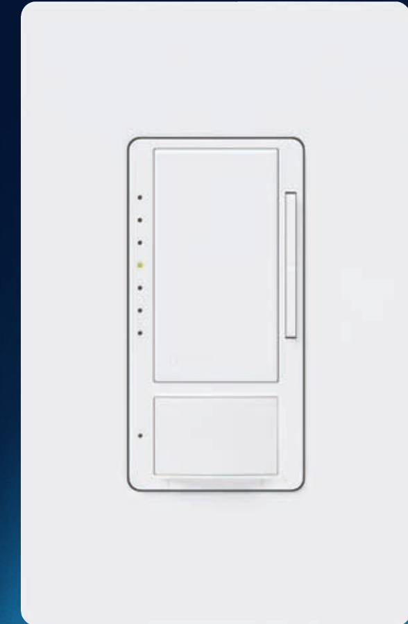
NEW Maestro occupancy/vacancy sensor with dimmer (actual size)

World Headquarters 1.610.282.3800 Technical Support Center 1.800.523.9466 (Available 24/7) Customer Service 1.888.LUTRON1