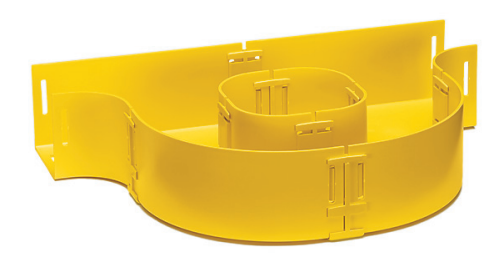
Pictured: Fiber Storage Loop Inline

Fiber Raceway Fiber Storage Loops allow excess patch cord lengths to be safely stored and organized thoughout the fiber duct system. Inline Storage Loops contain fiber within the duct system while the Offset Storage Loop retains fiber away from the main duct.