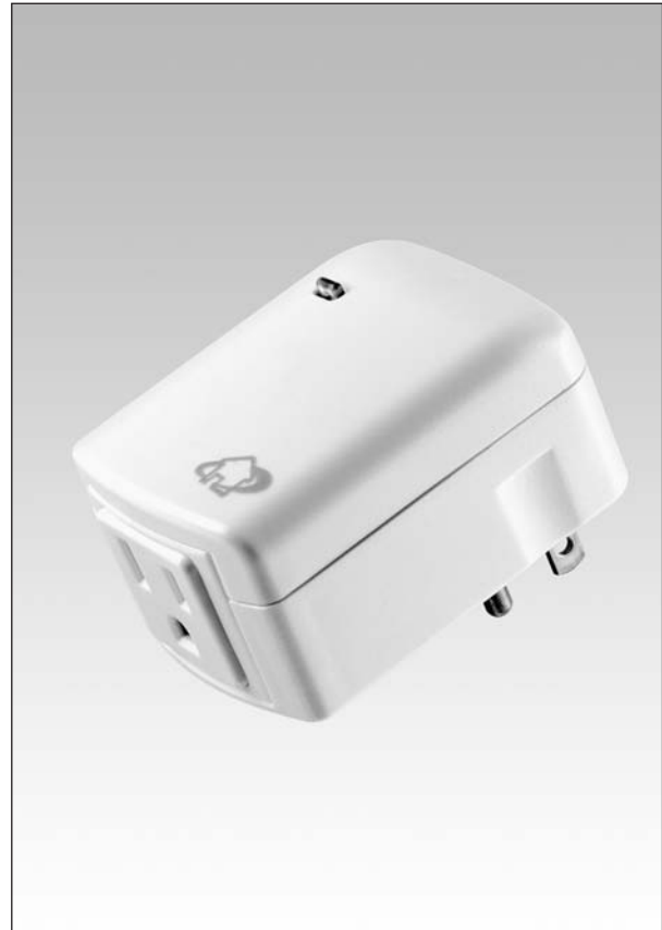
Cat. No. HXP15-1TW