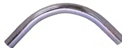
90° CEP EMT Elbow