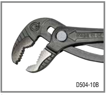
Quick Adjust™ style with push button feature