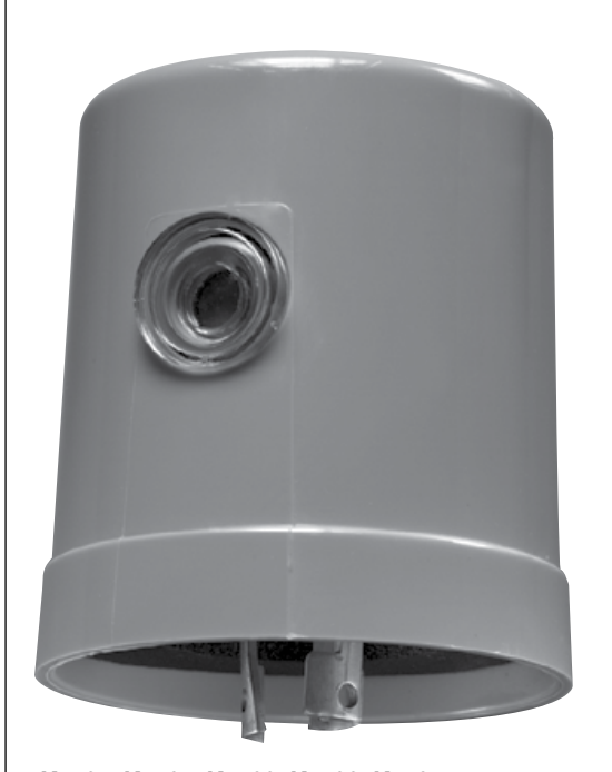
K4521, K4524, K4522, K4533, K4535