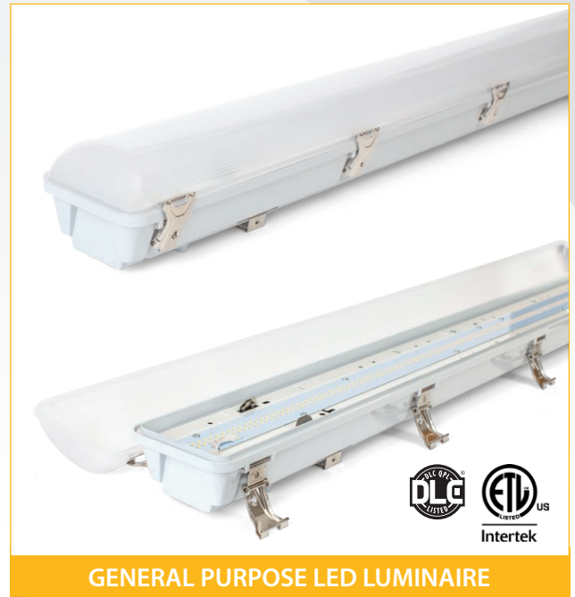
GENERAL PURPOSE LED LUMINAIRE