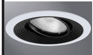
376P White Trim, Black Baffle