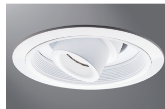
1412W White Trim with White Baffle and Lampholder