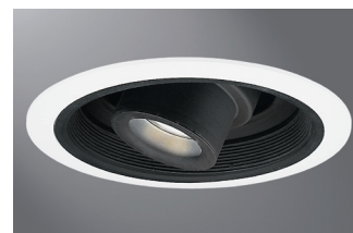
1412P White Trim with Black Baffle and Lampholder