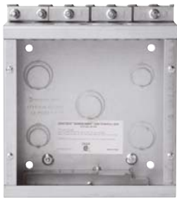
HomeRunner Box 8 x 8