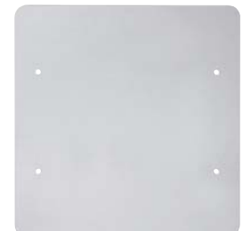
Flush Mount Cover