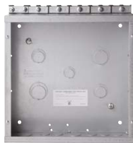
HomeRunner Box 12 x 12