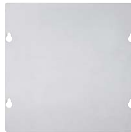
Surface Mount Cover