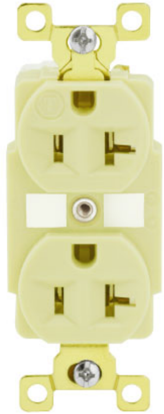
Straight Blade Duplex Receptacle.