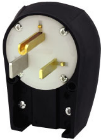
Angled Straight Blade Plug.