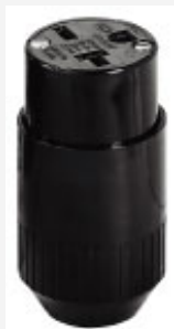
Straight Blade Connector.