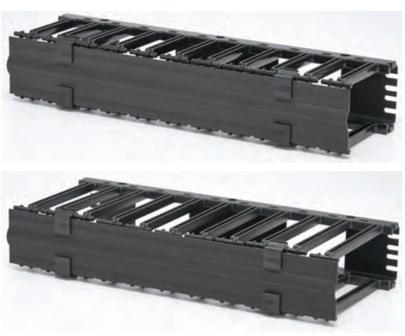
SB87019S2FB Standard Length (2U)