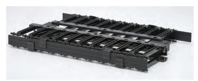
SB87019D1FB Standard (2U) Length