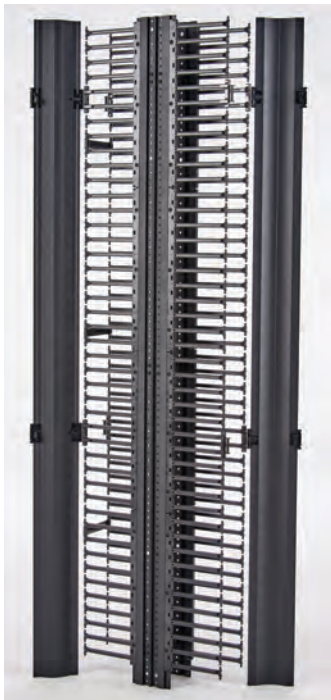
Double sided, 84" high x 6" wide SB86086D084FB

U.S. Patent 7,362,941 Other Patents Pending