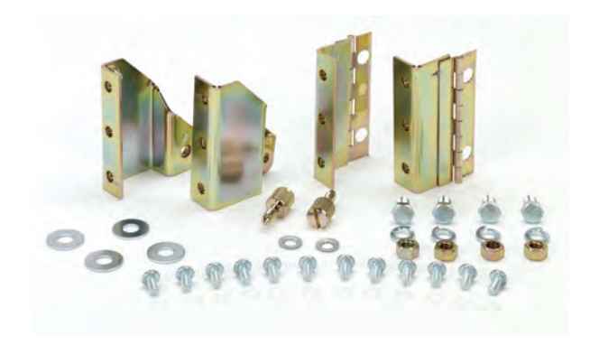
Illustration Sheet and Catalog Number