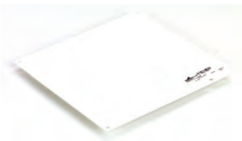
Illustration Sheet and Catalog Number