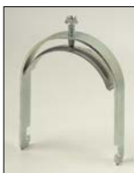
B1532S thru B1564S