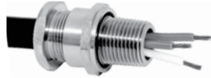
Dimensions in Millimeters (Inches)