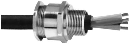
Dimensions in Millimeters (Inches)

CEC: Rated for Non - Hazardous Locations Type 4x