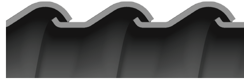
Angle-Lock Design 3/8" through 4"